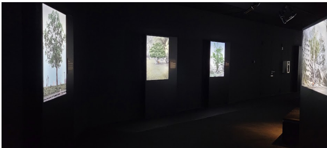
Photo 1 Photographs of special trees and Singaporeans who cherish them, Robert Zhao Renhui's 'Singapore, Very Old Tree' exhibit, National Museum of Singapore.

A contrast to the rest of the museum is a fascinating permanent exhibition titled 'Singapore, Very Old Tree', curated by the Singaporean multi-media artist, Robert Zhao Renhui, which provides rare alternative narratives to life in Singapore that stand in stark contrast to the endless succession of achievements claimed by a top-down technocratic state (Photo 1). The view of Singapore presented in this exhibition is nostalgic, at times mystical and superstitious, and is centered around direct action taken by regular Singaporeans to try to preserve trees that hold meaning to them against the constant destruction to make way for urban development, the widening of roads, and other urban transformations deemed by the state as 'progress'.