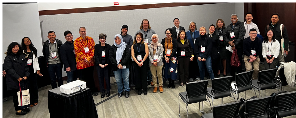
Photo 5 MSB attendee group photo after the meeting.

Note: The dinner was one of the best attended in recent years, with 24 members showing up.