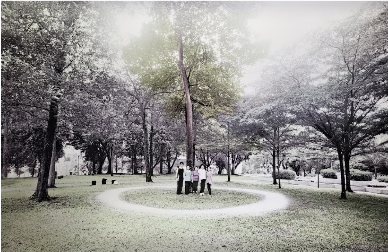
Photo 2 A group of practitioners of Ba Gua, a walking meditation, have worn a path from circumambulating a colonial-era rubber tree. Robert Zhao Renhui's 'Singapore, Very Old Tree' exhibit, National Museum of Singapore.

which they feel connected. Some people have relocated trees that were slated for destruction at their own expense, or have guerilla planted trees, most of which the state eventually discovers and destroys. One family's pastime is to collect seeds from saga trees and map the location of seed-producing saga trees on Google Maps for others to find. Citizens maintain a bamboo grove that was once behind a small Chinese temple along the train tracks. While the train tracks and temple are now gone, regular visitors to the bamboo grove report that they