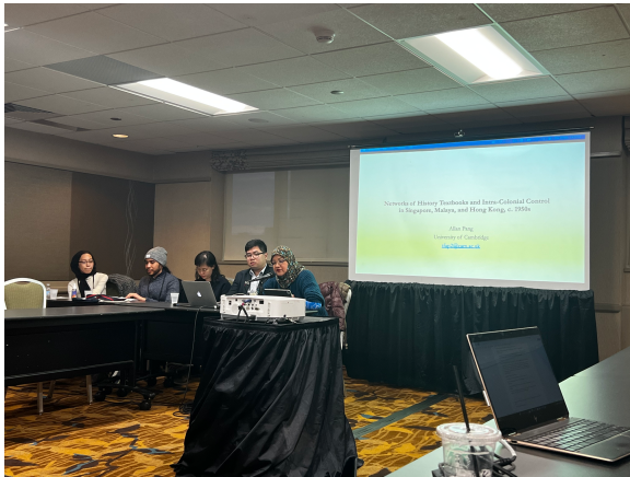
Photo 1 The MSB-sponsored panel entitled “Disturbing Artefacts: The Politics of Preserving and Presenting Histories of Singapore and Malaysia.”