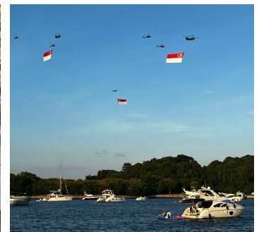
Photos (left): Malaysian community in Duluth, Minnesota gathering on Aug 31 to celebrate Merdeka with, what else, food! (right) RSAF helicopters as they get ready to fly over the Singapore National Day Parade, Aug 9.